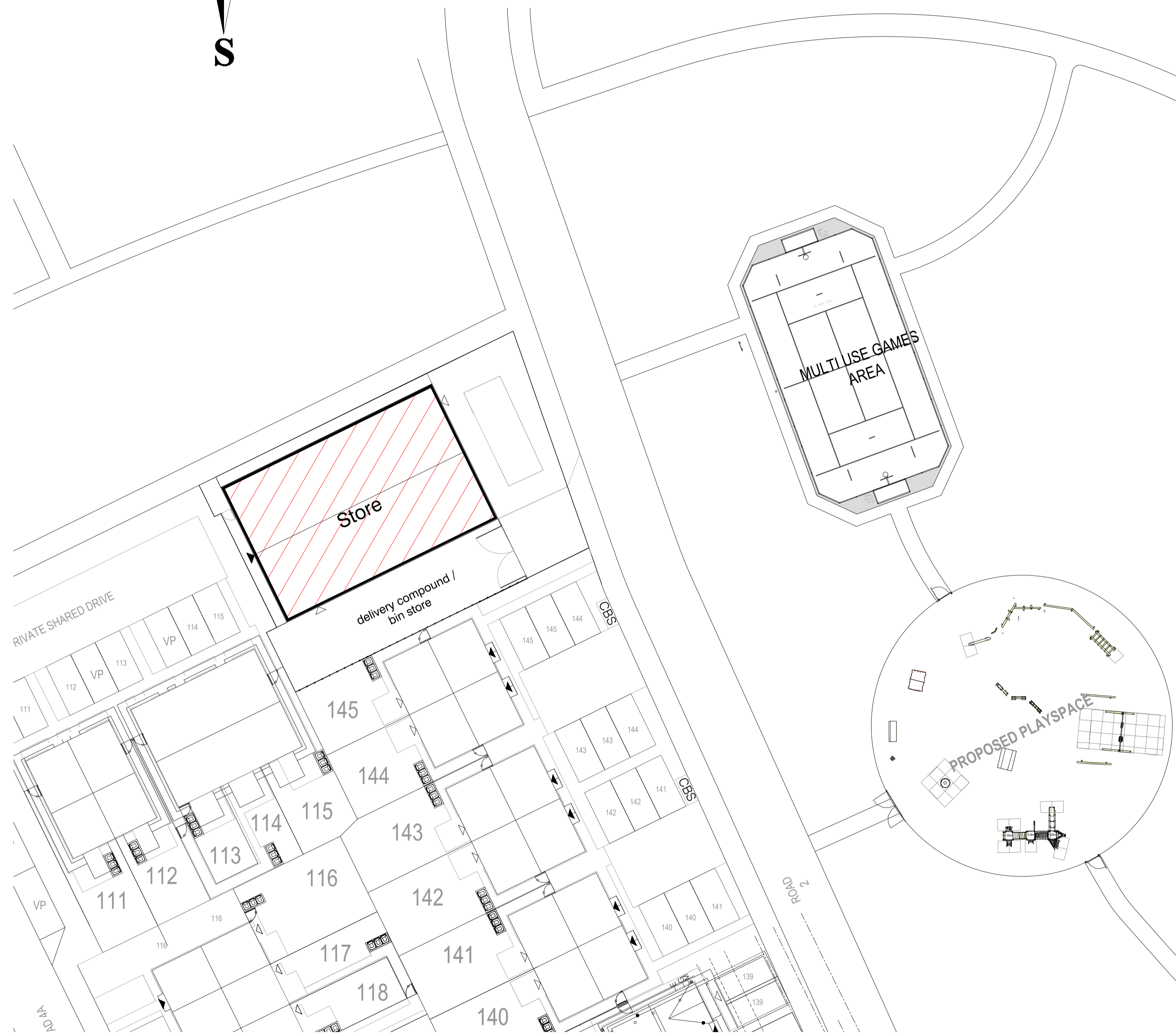
SITE PLAN 1:250