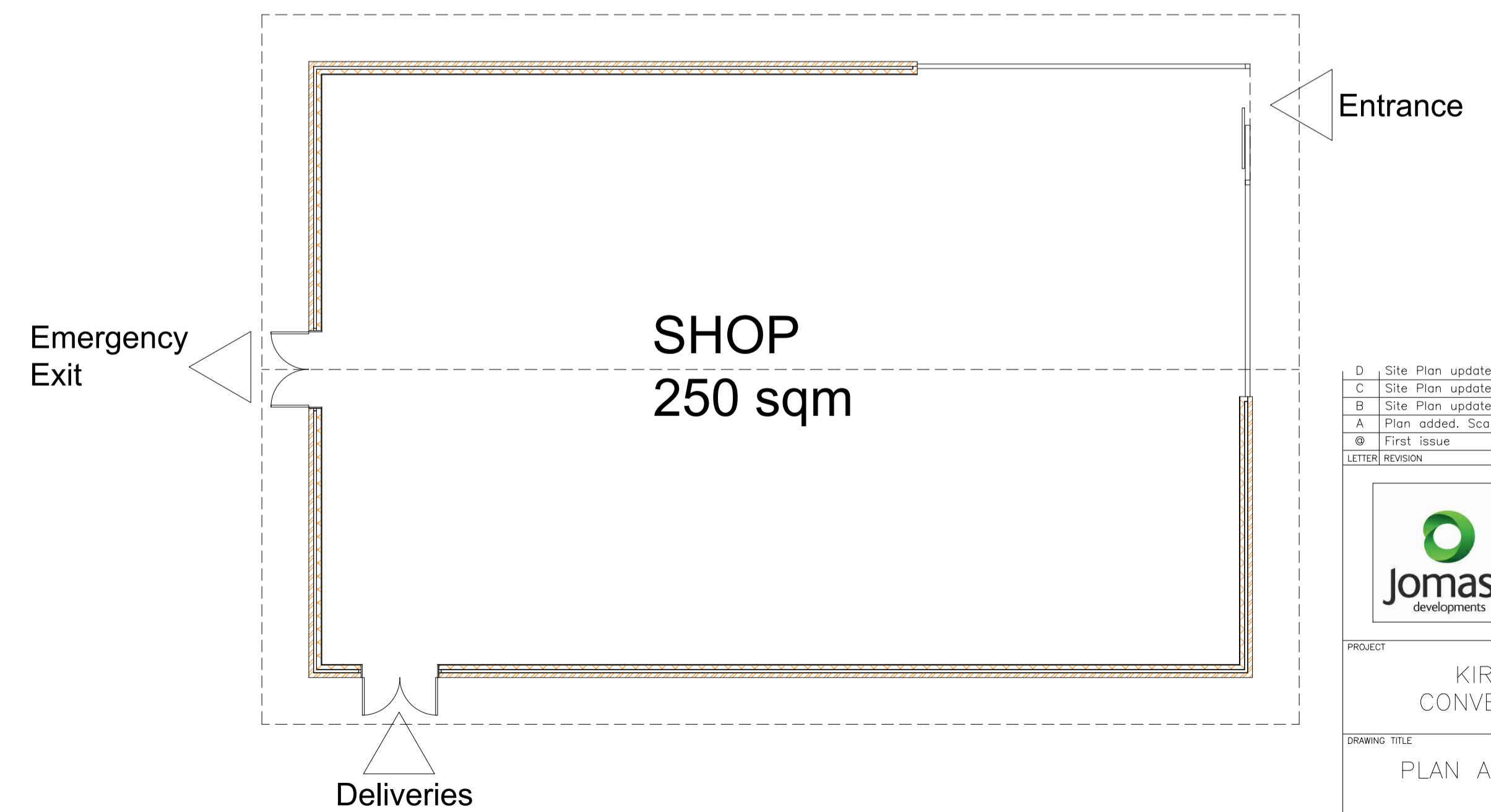
FLOOR PLAN 1:100